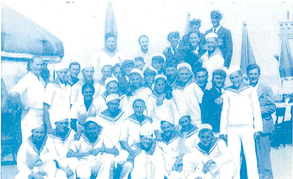
OUR FUTURE SAILORS. The youngest class at the Tel-Aviv training centre.

TEL-AVIV divided their 70 cadets into 3 classes, ages 15-17, 18-20 and older. Theoretical instruction includes elements of Seamanship and Navigation—Charts and Compasswork—Elements of boat and ship building—Rules of the Road—Signalling—Knots and Splices, etc. Training trips to Beyreuth and Cyprus proved the very satisfactory progress made by our cadets in practical work and roused great interest among local seamen, harbour authorities and Jewish residents in Beyreuth and Sidon. The idea of a Jewish Yachting Club is enthusiastically sponsored by former members of yachting clubs abroad. The Club would not depend financially on Zebulun, but would be called "Zebulun Yachting Club," if established. We still feel the great need for a bigger boat for our training trips, and hope that the generosity of our subscribers will enable us to supply this want before long.