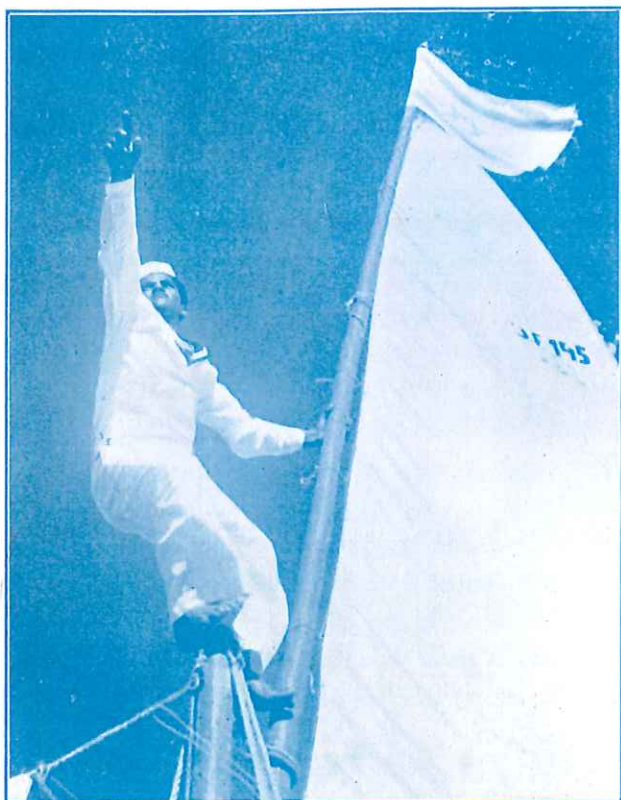
Look out at Whaler's mast head. (Cyprus in sight!)