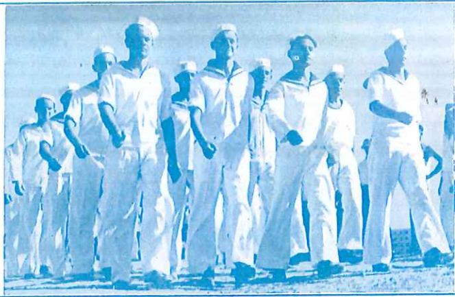
March of the Cadets.