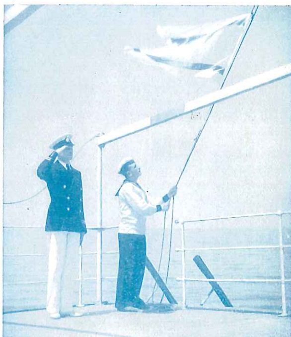
Hoisting the Jewish Flag.

As we go to press we are pleased to report further progress of the work of the Society. Three young Jewish sailors who have completed the necessary seetime are now in London where the Society is helping them to take the requisite courses at the Nautical Schools to enable them to sit for their 2nd Mate's Examination.