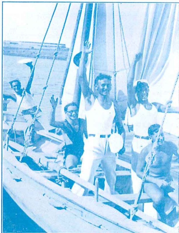
The oldest class of the Tel-Aviv-training centre. (The return from Cyprus)